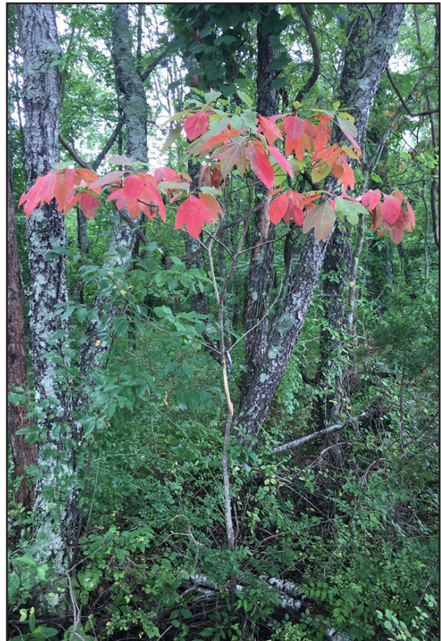
FIGURE 1. SYMPTOMS OF LAUREL WILT ON SASSAFRAS INCLUDE SUDDEN WILT AND RAPID DEATH OF BRANCHES. INITIALLY, LEAVES TURN A REDDISH COLOR (RESEMBLING FALL LEAF COLOR) BUT EVENTUALLY DROP, LEAVING STANDING, DEAD TREES.

Laurel wilt symptoms include sudden wilting and discoloration of the foliage (FIGURE 1), followed by rapid leaf death. Initial symptoms may resemble drought or water stress. Dead sassafras leaves appear reddish-brown in color and remain attached to plants for up to 2 weeks.