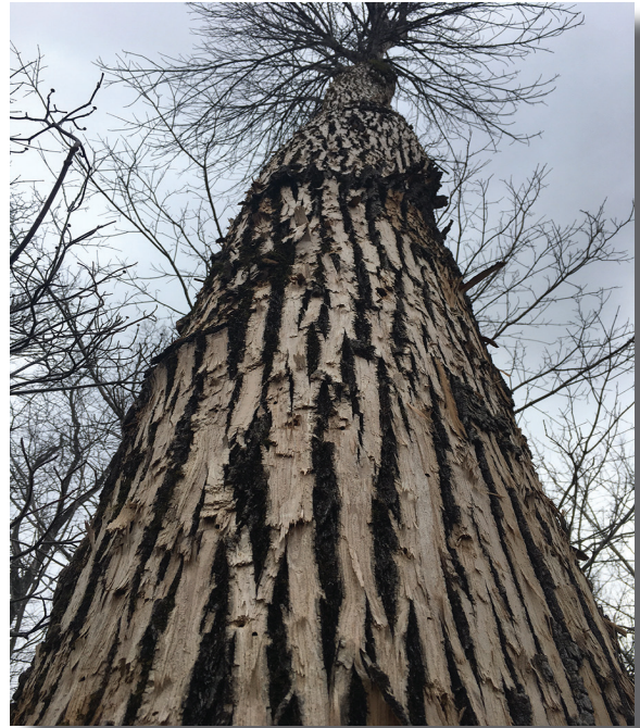
Standing dead ash tree.