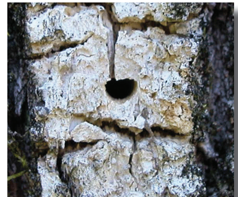
D-shaped EAB exit hole on an ash tree.