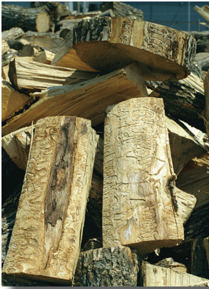
Pile of ash firewood showing EAB galleries.