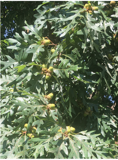
Figure 3: A large white oak can produce hundreds of pounds of acorns during bumper crop years.

chestnut and scarlet oaks, produce relatively high numbers of acorns every year. Others may go several years between bumper crops. In non-bumper crop years, many of the acorns produced fall prey to both insects and wildlife. Oak weevils, a grub that feeds on acorns from the inside during the summer and early fall, ensure that many acorns will not germinate. It is also well known that acorns are a favorite food of many wildlife species such as deer, squirrels, turkeys and bears. These animals and others rely heavily on acorns as a source of nutrients especially during the winter months when other food sources are scarce. Therefore, it takes a heavy acorn crop, for some to survive the insects, birds, and mammals that feed on them. Unfortunately, many oak species do not produce heavy acorn crops every year, which limits the number of seedlings established the following year.