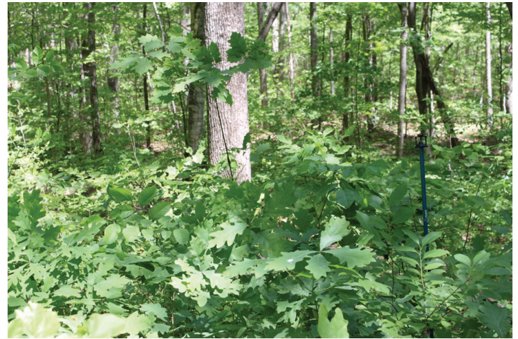
Figure 5: This photo shows a white oak with white oak advance regeneration that has been developed prior to a timber harvest. White oak now has an excellent chance of being a dominant component of this forest for decades.

The knowledge and understanding of these characteristics have resulted in the development of a number of management techniques to aid oaks. Foresters and landowners now have a number of techniques to help successfully regenerate oaks in our forests. As suggested, many of these techniques involve the manipulation of sunlight by removing specific amounts of undesired trees. This process often involves multiple treatments conducted over several years to establish the advance regeneration needed to maintain oak as a component of the forest. Implementing these techniques can at times be challenging financially and operationally. However the end result is the successful management of a healthy upland oak forest. Without this effort, the future of our upland oak forests is uncertain.