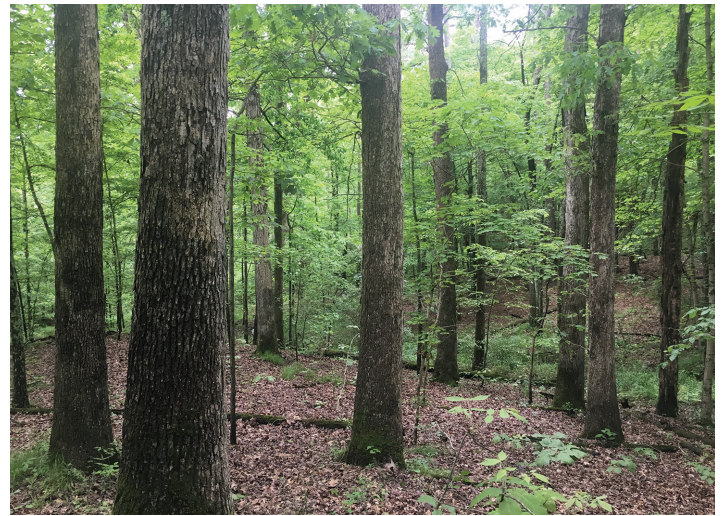
Figure 4: There is almost no oak regeneration in this white oak dominated stand. In the back of the photo there appears to be abundant reproduction, however the species are primarily sugar maple and hickories, with no oaks.

seedlings. If oak seedlings can get the right amount of light to reach a competitive height, they have a much better chance of competing with other species after a harvest. This height varies, typically from 3 to 4 feet tall to 1 inch in diameter at breast height. The variation in height required, as an indicator of vigor, is often based on the site. For example, some sites that are inherently dry and of lower productivity have fewer competing species, and the advance regeneration size of a species like white oak can be smaller than would be needed if it were on a highly productive site with more competitors.