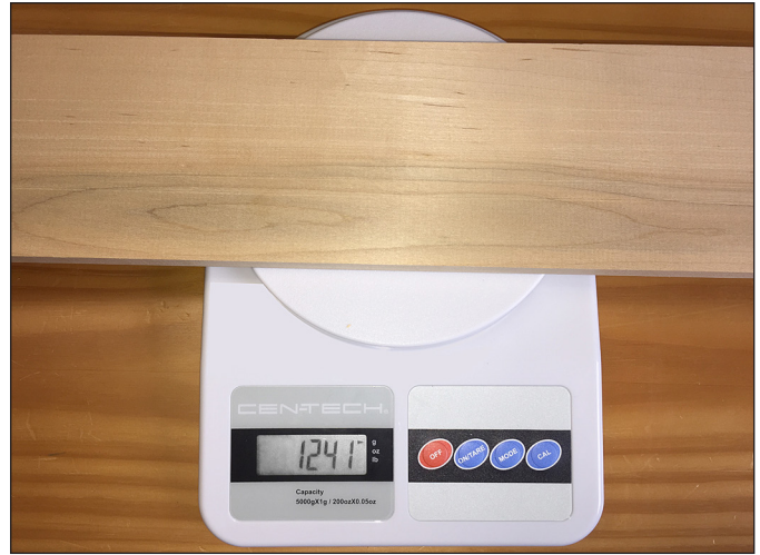
Figure 2. An example of an inexpensive intermediate-size balance. This one weighs up to 5000 grams (eleven pounds), and I use it to weigh sample boards. It's suitable for 4/4 sample boards and for many 8/4 sample boards, though that depends on the moisture content and the density. You will probably need a higher capacity balance if you dry 8/4 lumber.

I've found that small consumer-grade ovens often have inaccurate temperature settings and may have wide temperature swings. I added a digital oven thermometer to my own small convection oven and clipped the wired sensor to a shelf inside the oven so I could be sure it was hot enough; having that oven thermometer gives me confidence that the oven is actually drying my samples at a high enough temperature.