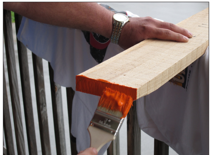
Figure 4. This is an example of a proprietary end coating used to prevent moisture loss from the ends of sample boards. The Bright Orange Sample Sealer (B.O.S.S.) shown here is sold by Anchorseal.

The moisture variability in the lumber will likely be similar