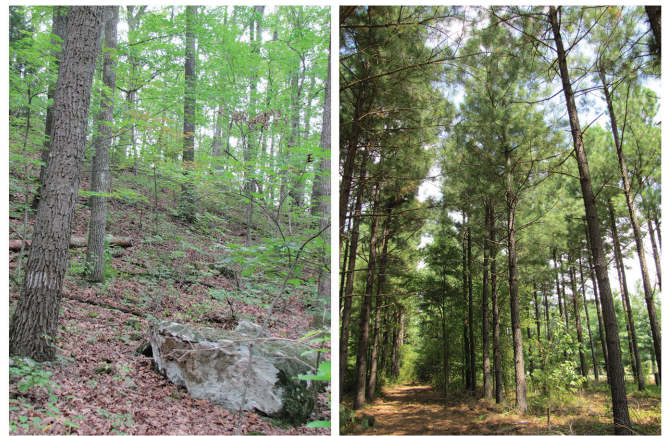
Certain animals will prefer pine stands (R) over hardwood stands (L) and vice versa.

'Cover' refers to any type of habitat that an animal considers their temporary or permanent home. Salamanders