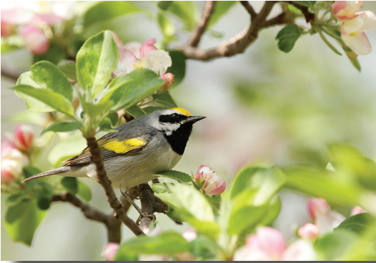
Golden-winged warblers need shrubby thickets for breeding but mature forests to raise their young.

Wildlife's specific habitat needs may depend on the age of the woodlands. Young woodlands are covered in thousands of tree seedlings, bushes, and vines. As woodlands age they provide different types of habitat structures that are desirable for wildlife. Golden-winged warblers nest