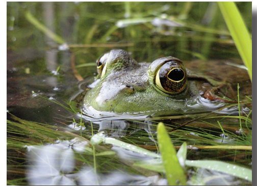
Frogs and other amphibians will be attracted to woodland waterbodies.

Woodlands are already a great place for wildlife to live. Small woodland owners should review what habitats are present in their woodlands and compare them to their neighbors. By focusing on improving access to food, cover, or water, landowner's can attract even more of their favorite birds, frogs, bats, deer, or any other animals.