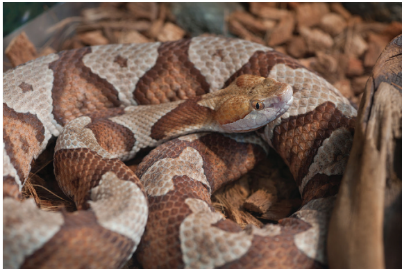
Copperheads eat a wide variety of animals including mice, birds, small reptiles and amphibians.

Woodlands may already be home to birds, bats, snakes, salamanders, turkeys, white-tailed deer, and many other types of wildlife. But how can woodlands be improved